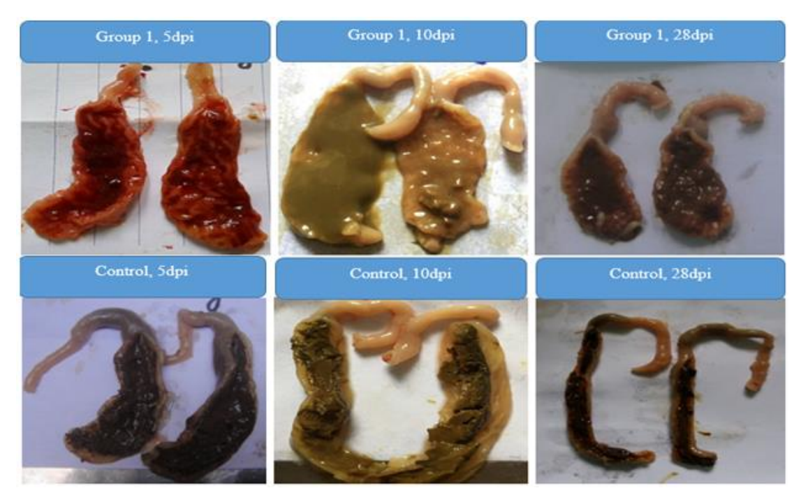
Figure 2. Morphological changes in ceca during Eimeria infection

The results show that ceca are the most damaged part of the gastro-intestinal system of Eimeria treated chickens. The ceca of infected chickens are damaged with a large amount of blood in the ceca content at 5 dpi. Then, they seem to recover without bleeding, but the chickens still suffer from diarrhea at 10 dpi. The ceca slightly thicken at 28 dpi. Meanwhile, the ceca of control chickens are in normal condition.