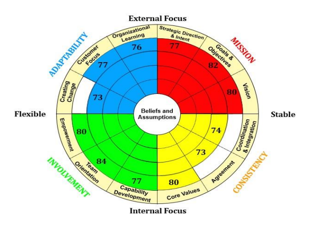
Figure 3. Organizational culture of enterprises in Thua Thien Hue based on the Denison model. Note: 1- point in the Likert scale is equivalent to 20-points in the Denison model

difficulties to reach agreement on critical issues. This includes both the underlying level of agreement and the ability to reconcile differences when they occur.