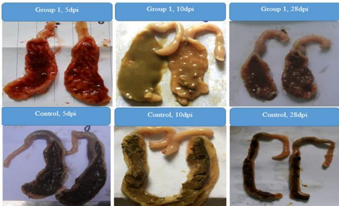
Figure 2. Morphological changes in ceca during Eimeria infection

The results show that ceca are the most damaged part of the gastro-intestinal system of Eimeria treated chickens. The ceca of infected chickens are damaged with a large amount of blood in the ceca content at 5 dpi. Then, they seem to recover without bleeding, but the chickens still suffer from diarrhea at 10 dpi. The ceca slightly thicken at 28 dpi. Meanwhile, the ceca of control chickens are in normal condition.