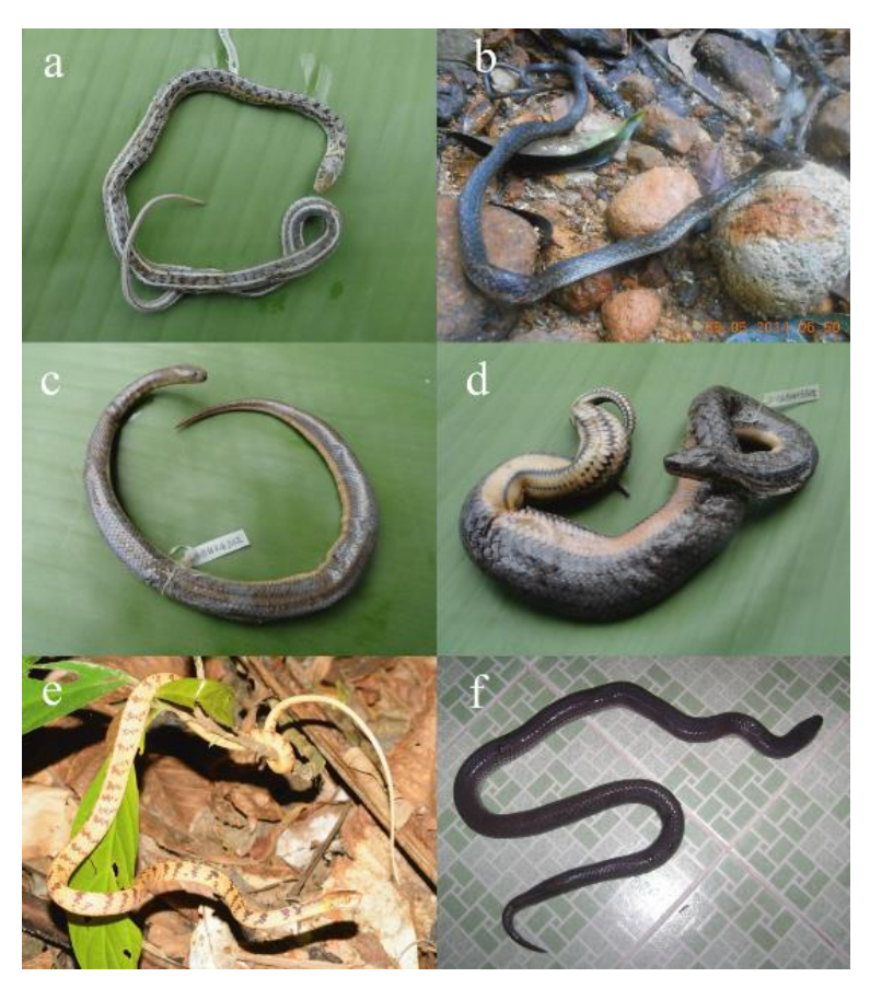
Fig. 2. a) Amphiesma stolatum (CLBH 13307), b) Hebius leucomystax (CLBH 14336), c) Enhydris enhydris (CLBH 14312), d) Enhydris subtaeniata (CLBH 13321), e) Pareas hamptoni (CLBH 14307), f) Xenopeltis unicolor (CLBH 12303) from Binh Dinh Province, Vietnam.